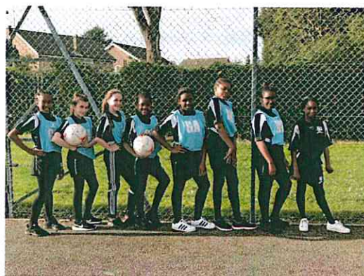
Fig. 6 Yr 7 Netball Team end of season photo

Recently the GCSE Drama students presented four outstanding pieces as part of their assessed work. Drama is one of the few subjects where being in the examination room is not just interesting, it is positively enthralling. A great testimony to their hard work and that of the drama team.