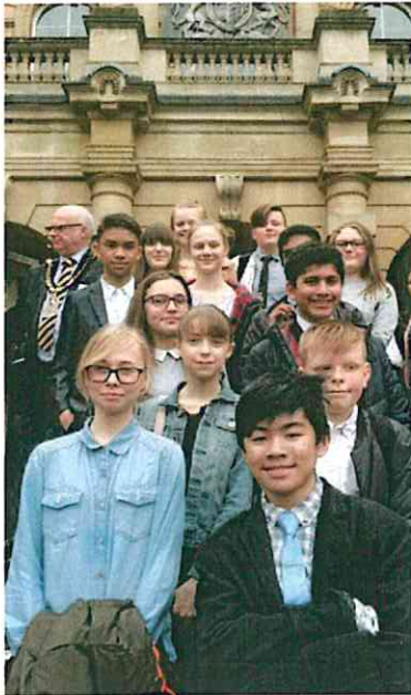
Fig. 7 The Blessed Hugh 'Mock Trial' team did a brilliant job arguing a legal case in front of a real magistrate who complimented them for their persuasive argument.