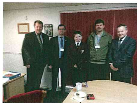
Fig. 2 Signing our partnership agreement with St John Bosco Catholic School, Bardejov, Slovakia

We were delighted to form a partnership with a Catholic school in Slovakia in recent months. The students from the St John Bosco Gymnasium [secondary school] will visit us later this year.