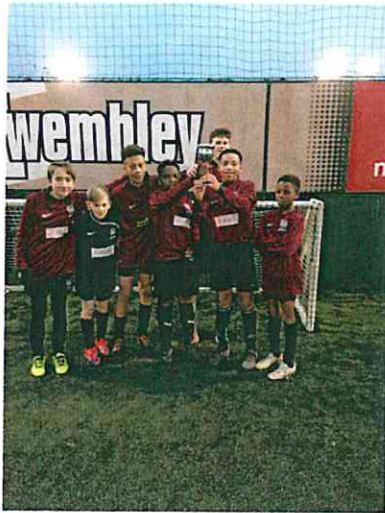
Fig. 1 A wonderful moment as our U13 boys became Reading 5-a-side champions.