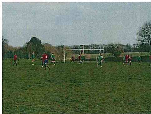
Fig. 7 Our U13s football boys continue on their unbeaten run, winning 2-1 against Chiltern Edge and 10-1 against Oakbank.

The up-to-date Behaviour for Learning and Uniform policies are available on the school website or from the school in hard copy.